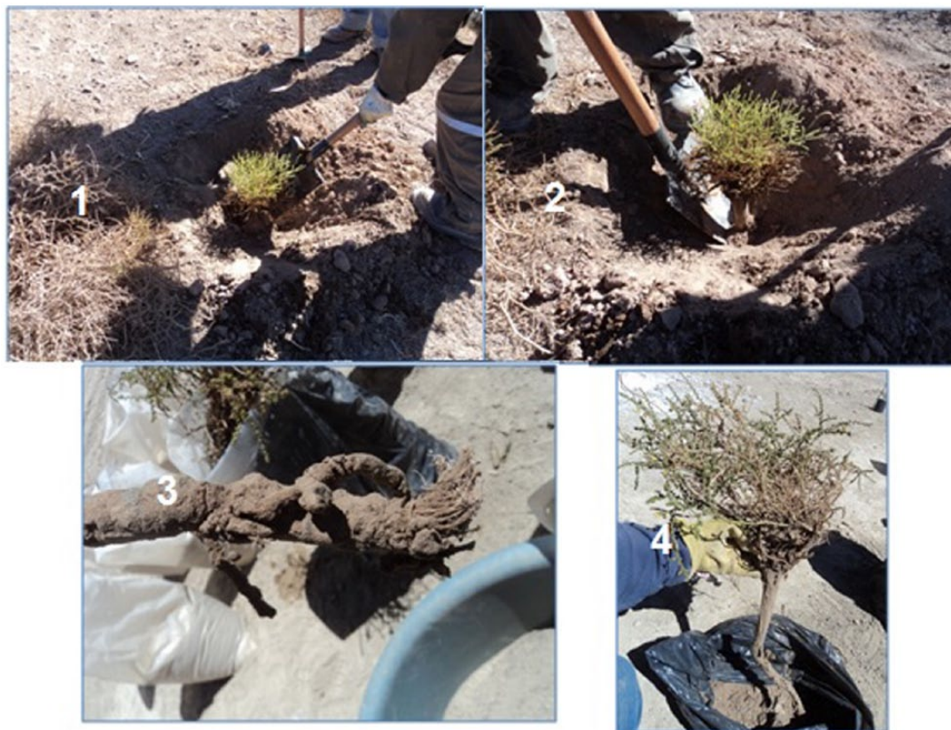
Figure 2. Photographic sequence of the extraction process of the specimens: (1) excavation of the delimiting furrow, (2) pruning of the plant, (3) extraction of a specimen, and (4) transfer of the specimen to a black bag.

VC in 1 kg of tailing (T2). In addition, for treatments T1 and T2 (T0 was not considered because it is the control treatment), the previously mentioned levels of mycorrhiza were considered: 0, 10, 15, and 20 g m -2 .